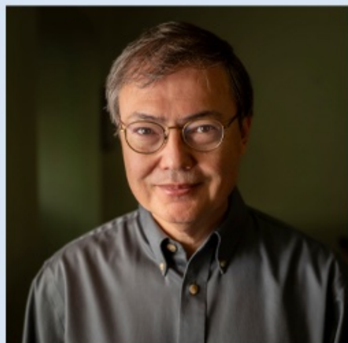
David Mullen, ASC

This year's lineup features some of the strongest representation from the world of cinematography to date. Speakers include: