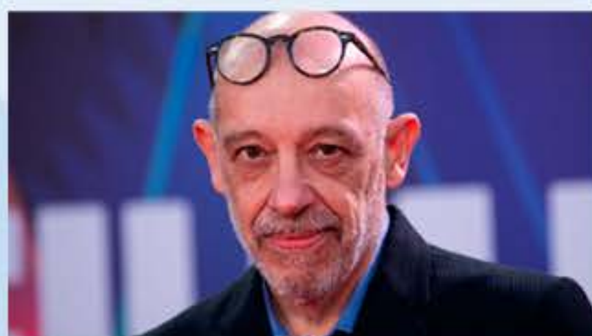
BRUNO DELBONNEL, AFC,ASC